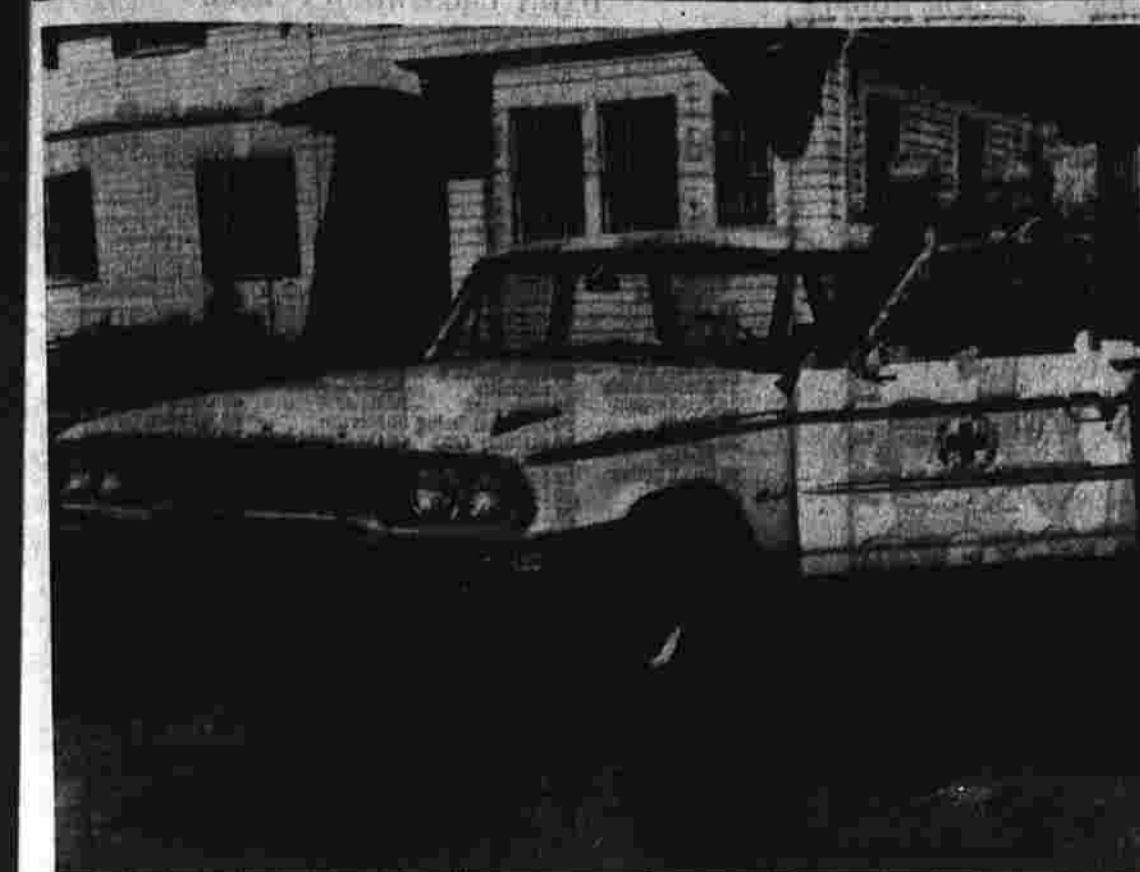
This new station wagon has been purchased by the Manchester office of the Red Cross for use by the motor corps...