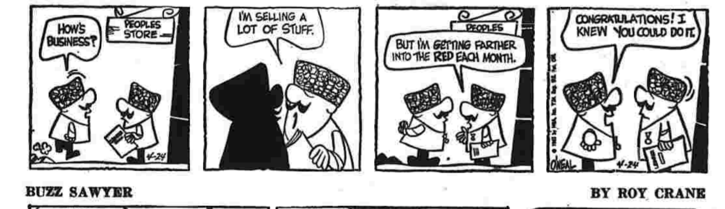
SHORT RIBS BY FRANK O'NEAL