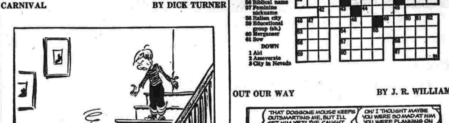
CARNIVAL BY DICK TURNER