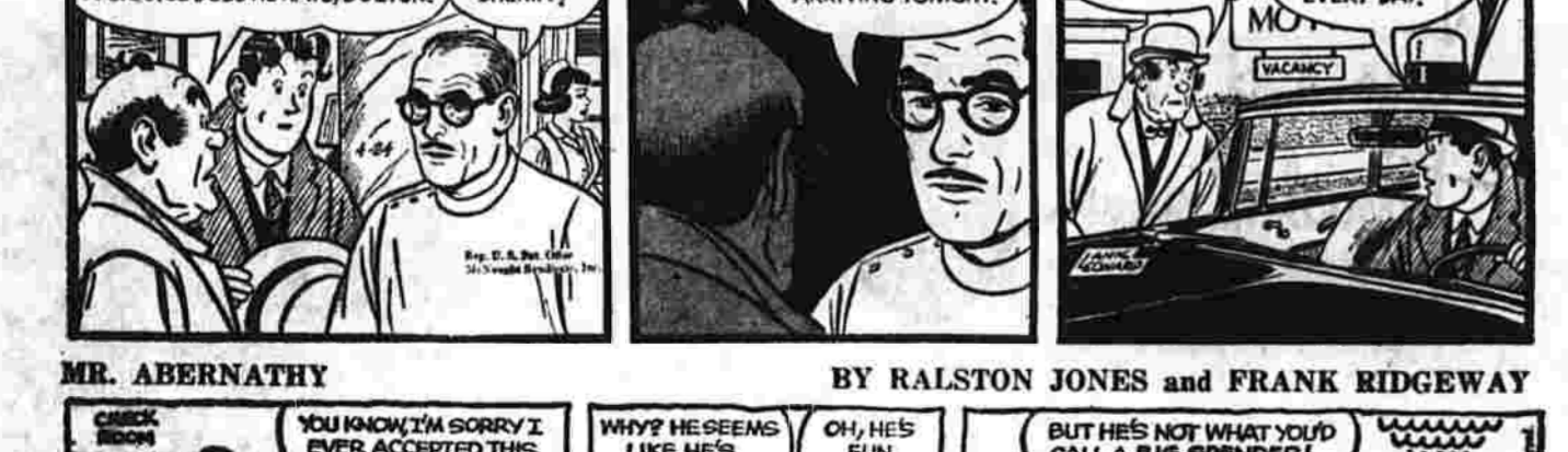
MICKY FINN BY LANK LEONARD