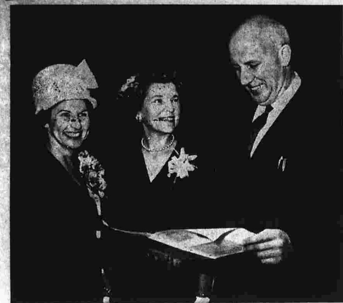
Apparently anticipating with relief PTA "adventures" about to get underway this morning at Manchester High School...